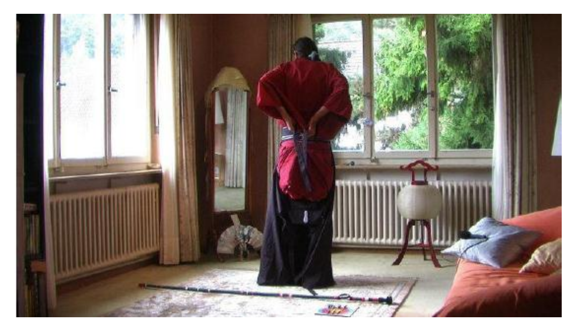
Fixing the front part of the Hakama