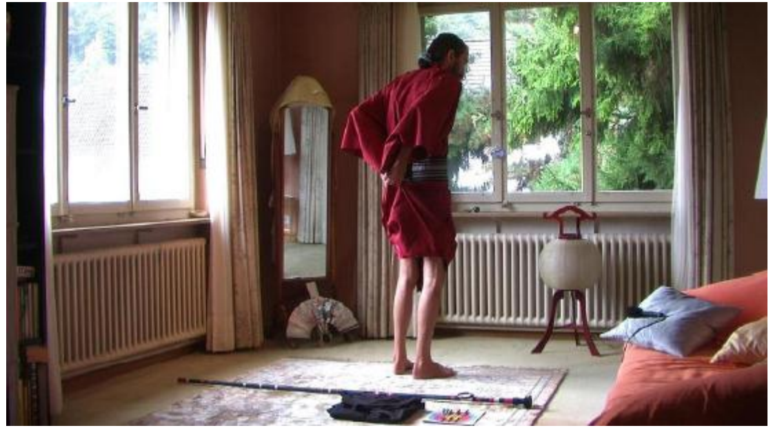
The back side of the Kimono is placed under the Obi, for free movement of the legs