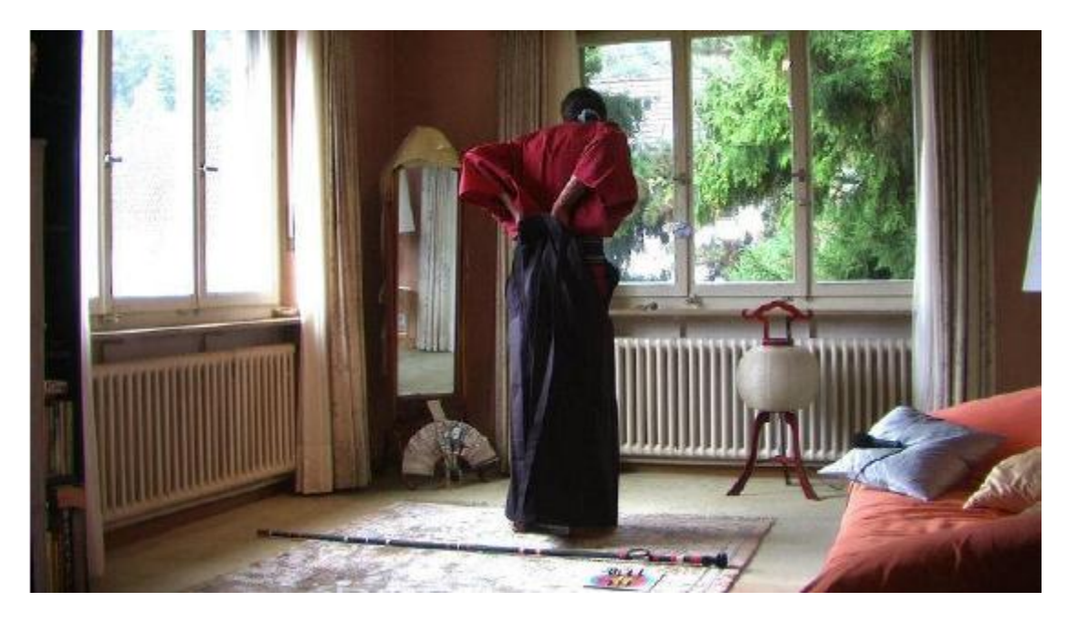
Fixing the back part of the Hakama