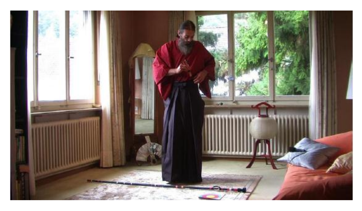
Placing the Yas -the arrows- between the belt