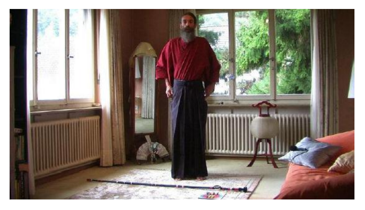
The complete look of the clothing