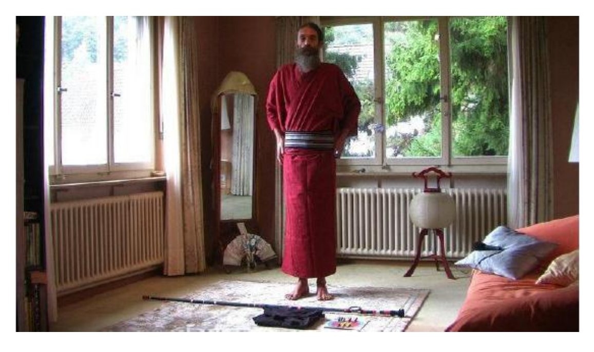
Obi – the belt