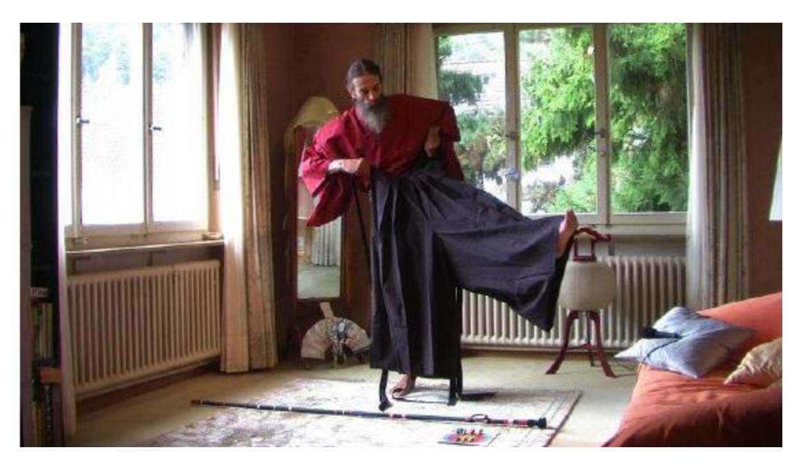
The Hakama (consists of two parts: front- and backside)