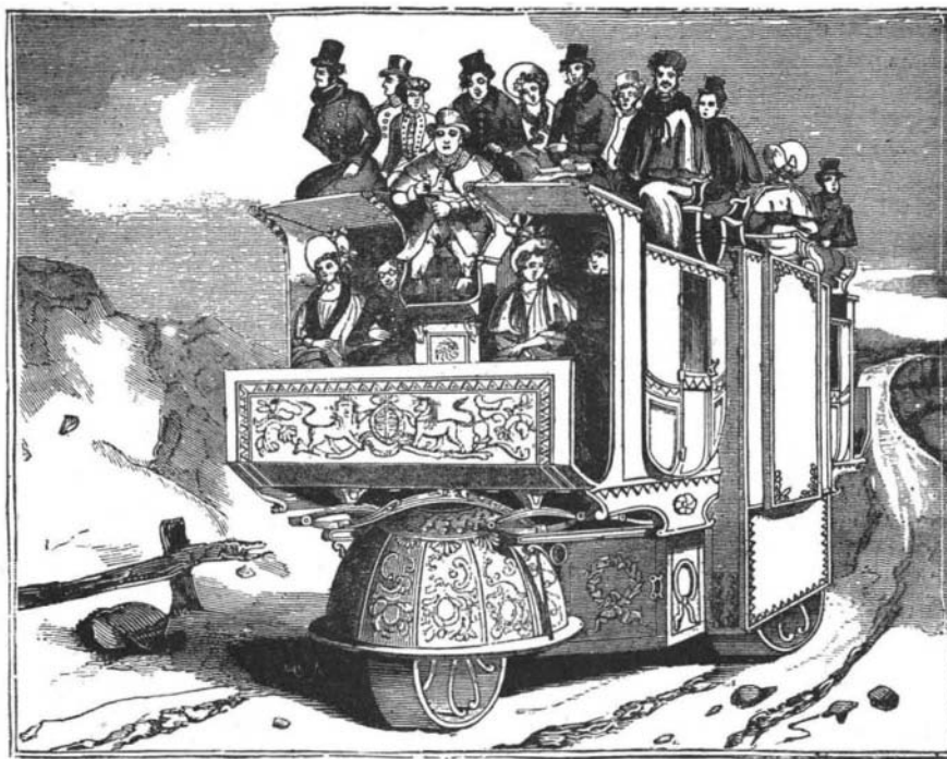
DR. CHURCH'S STEAM OMNIBUS.

The general form of the palace resembles somewhat a Latin cross. It will cover about 42,000 square feet, being 217 feet long by 194 feet wide. The grand central tower will be octagonal in shape, 50 feet in diameter and 105 feet high. The building will be a roofless shell, the surrounding walls averaging 23 feet in height. The main entrance will be in the form of a triumphal arch, surmounted by a sitting figure of King Borealis with his attendant bears (rampant) at either hand, all to be carved in ice. This archway will be 16 feet wide and 15 feet high. The wall will be 9 feet thick. The wing forming the foot of the cross, in which will be the main entrance, is circular in