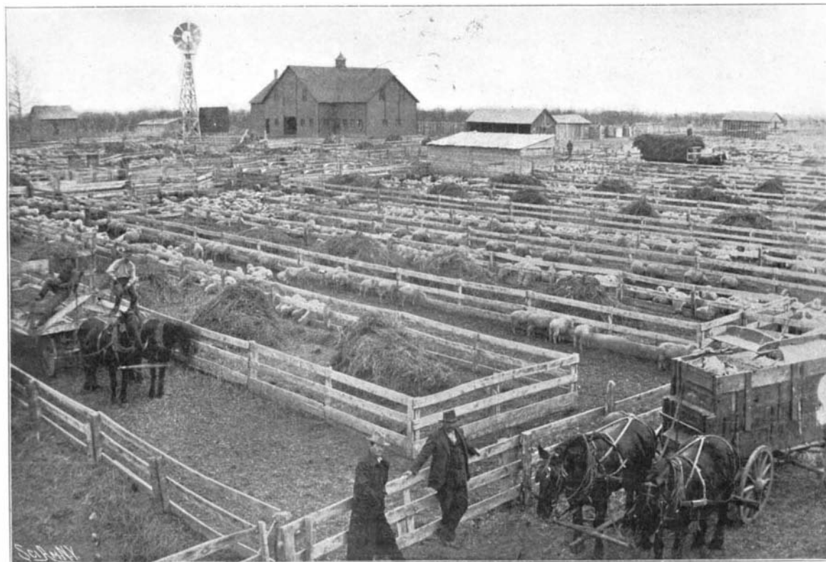
Pens on a Western Sheep-Ranch, where the Animals are Fattened with Alfalfa.

The tendency among the western cattle growers is to raise more quality and less quantity, and for this purpose a number of very valuable herds of pure-blooded stock have been imported within the last few years from Great Britain. Nearly every large ranch has at least one or two registered bulls and as fast as possible live stock growers are improving their strain. There should be no danger, however, of a meat famine on account of this revolution in cattle raising, for last year government statistics showed fully 25,000,000 beeves, nearly 50,000,000 sheep, and about 30,000,000 hogs owned by farmers and ranchmen in the United States.