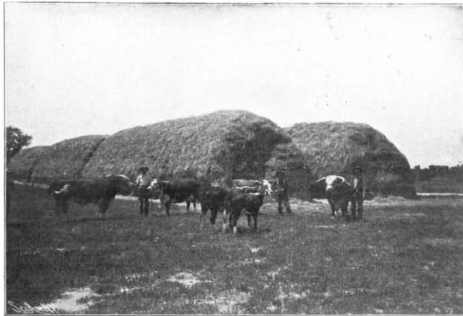
Western Cattle, Raised on Reclaimed Desert Land and Fattened with Alfalfa

a start, when it does its own weeding. In fact it is very independent and practically takes care of itself until it is ready for the blade of the harvester. It can be piled or stacked like timothy or any other forage crop, and when properly piled in a field is proof