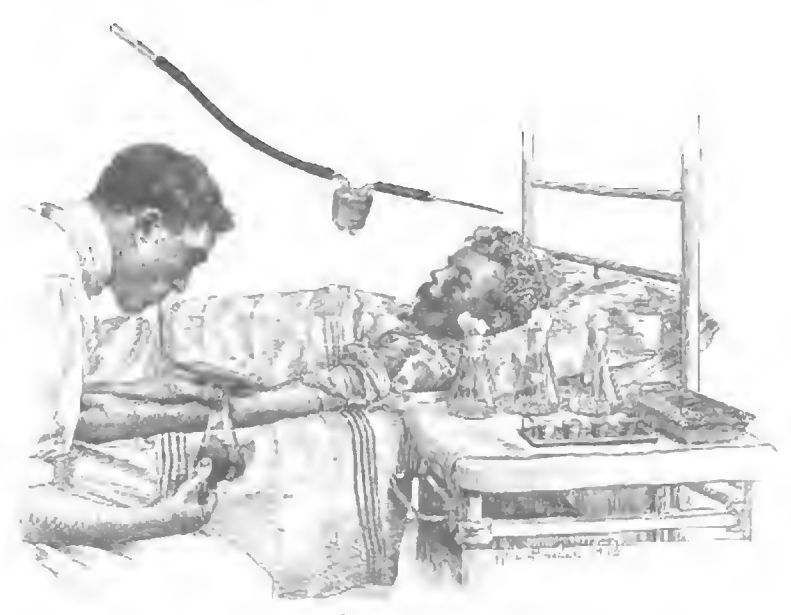
FIG. 1.-Obtaining blood from the donor.

Obtaining Blood from the Donor. The skin over the large veins at the bend of the elbow is rendered aseptic, a muslin bandage is placed around the upper arm tightly enough to cause the veins to stand out prominently, but not so as to obliterate the arterial pulse, the needle of the aspirating apparatus is introduced into one of the large veins, and blood aspirated rapidly into the flask by means of suction applied to the appropriate tube with the mouth.